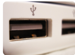
Recorder with usb port