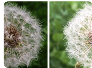
Auto exposure control to counter high intensity of light