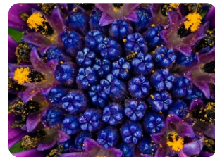
High Definition image quality