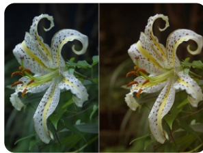
Auto white balance