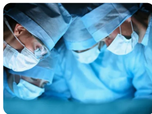
Strategically position to allow unrestricted access to cavity even with multiple surgeons